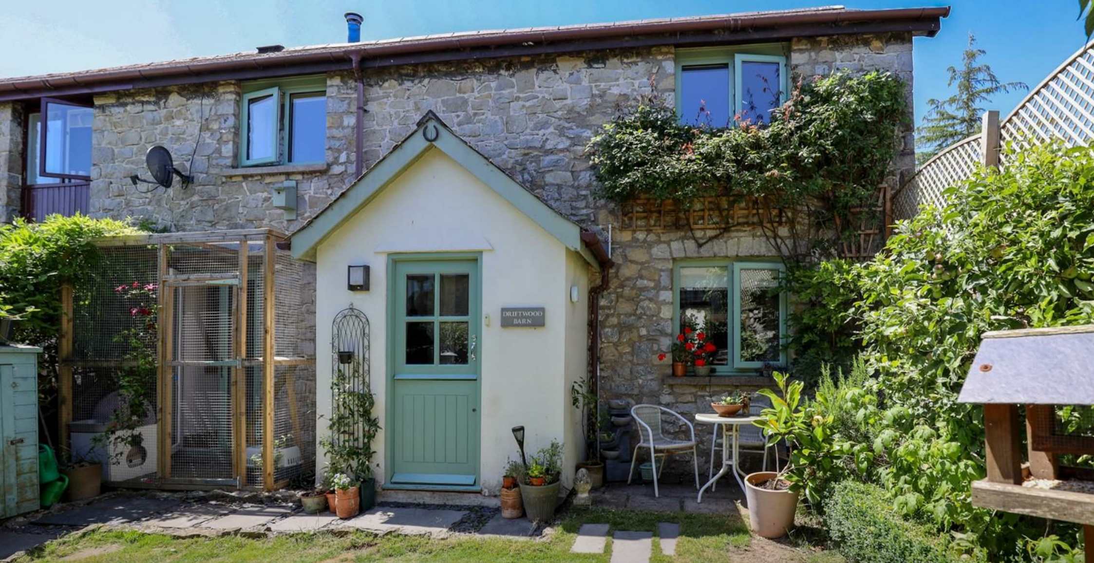
Driftwood Barn, 8 Fferm Y Graig St. Athan, Vale of Glamorgan, CF62 4QQ